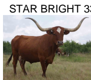
STAR BRIGHT 330